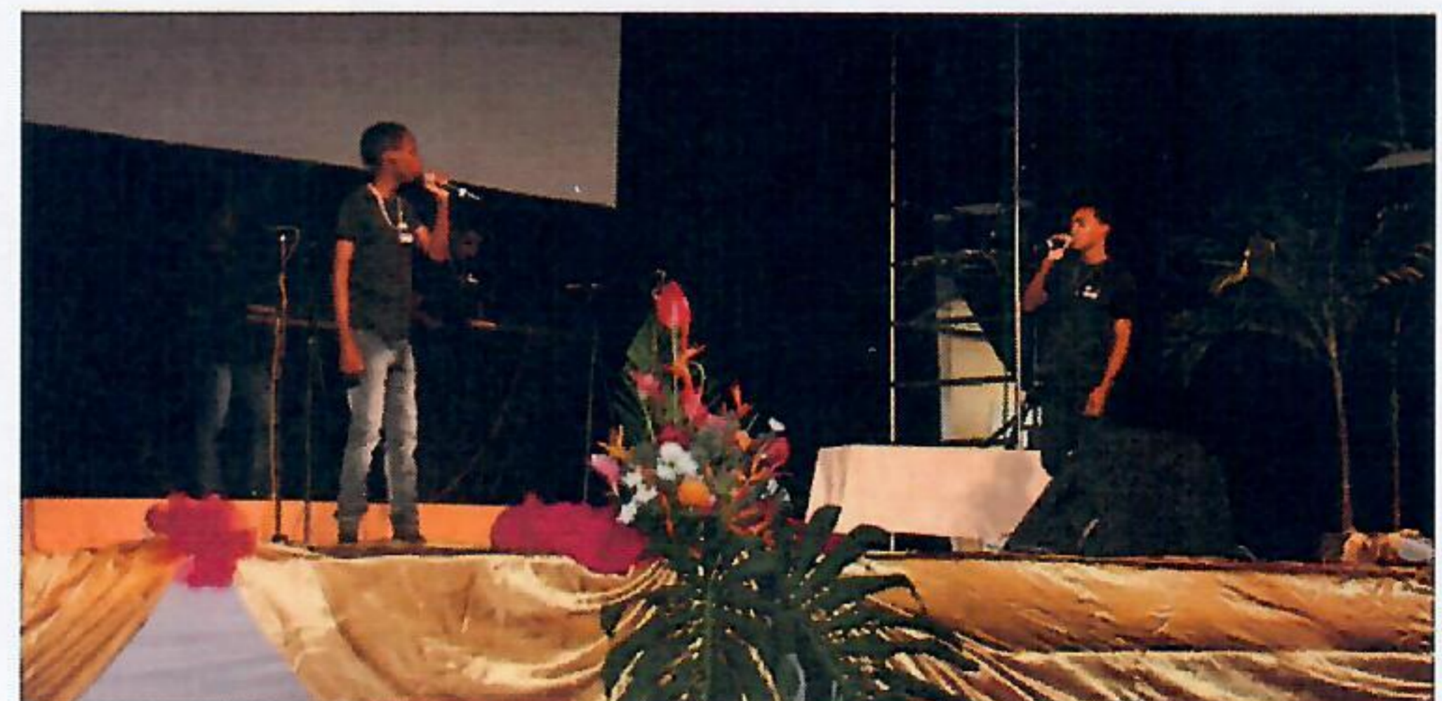
The Youth Band were the last performers of the afternoon