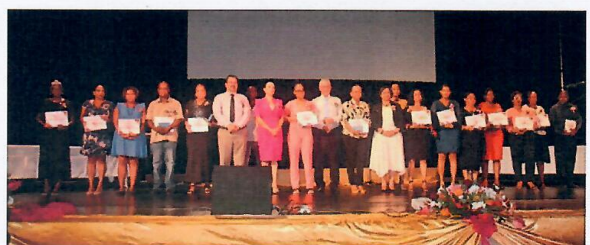
Staff who were awarded for ten years of service