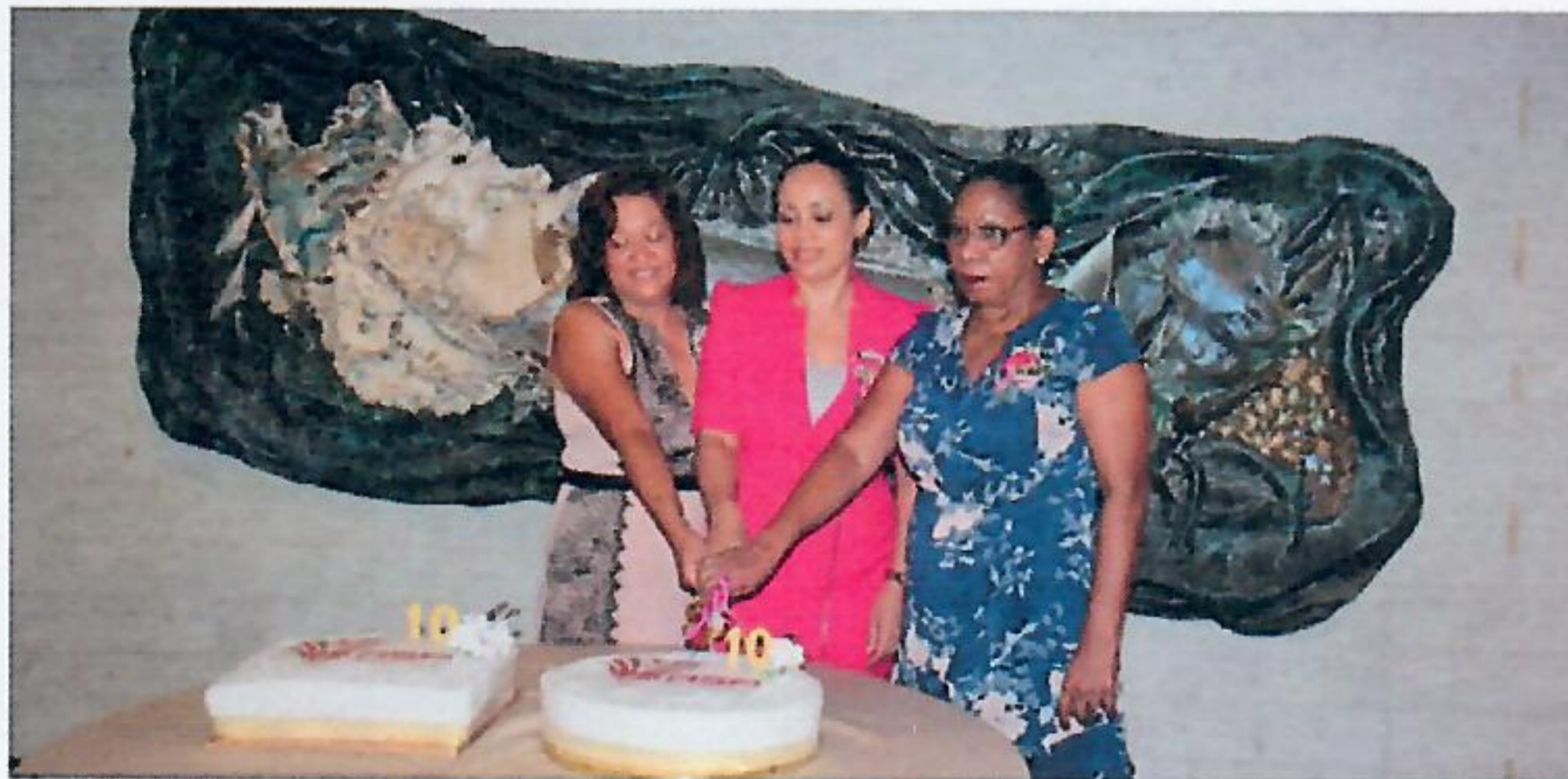
The cutting of the ASP cake