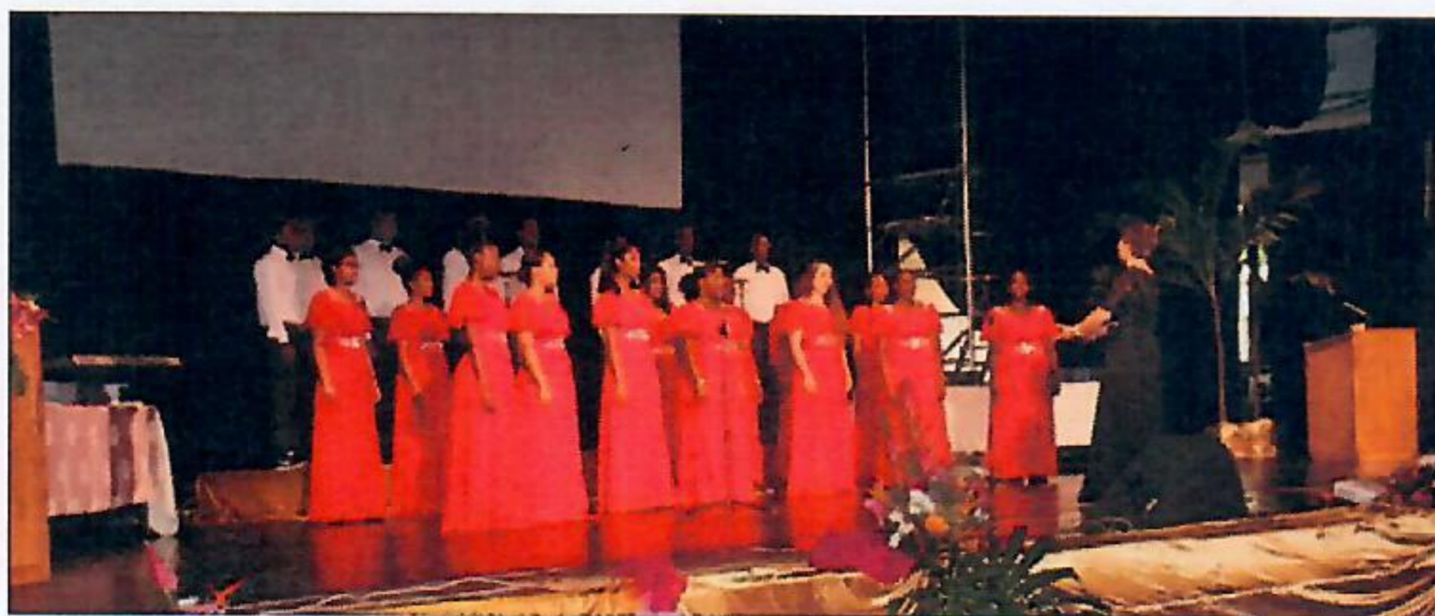
The National Choir performed three memorable musical performances