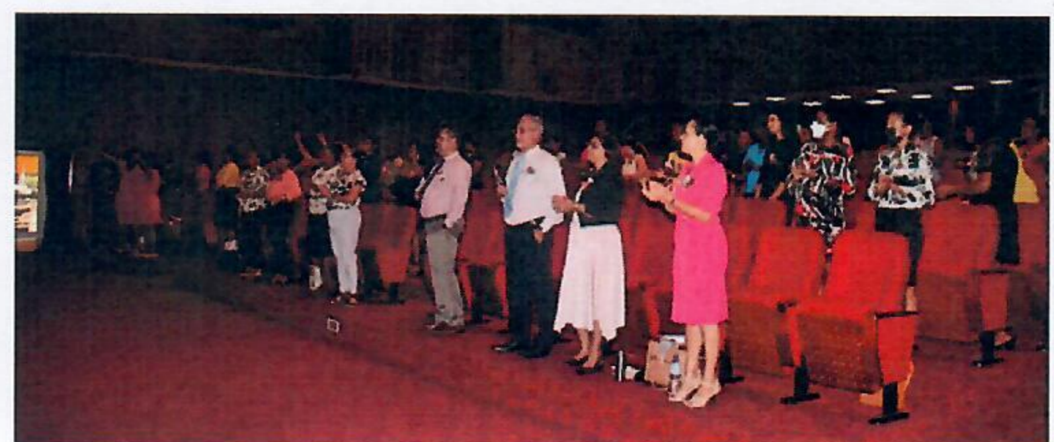
Applause for the staff of the ASP